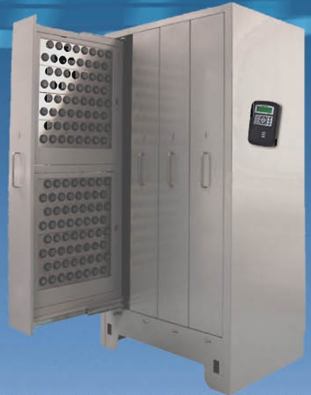
Flexible, Modular and Expandable