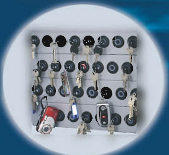
Keys and Valuables Safe-keeping