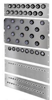
panel small/large space