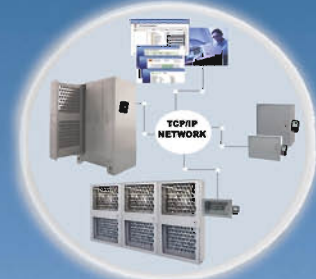
Network Friendly/ Powerful Web-based Software