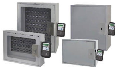
flexx32/flexx64 (clear/steel door)

The powerful software is capable of allowing the administrator to remotely release any keys via the web browser without the need to be physically present at the system.